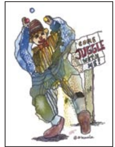
JO DUNNICK Dexter, Oregon "Come Juggle With Me" Watercolor, 8 x 6, $275