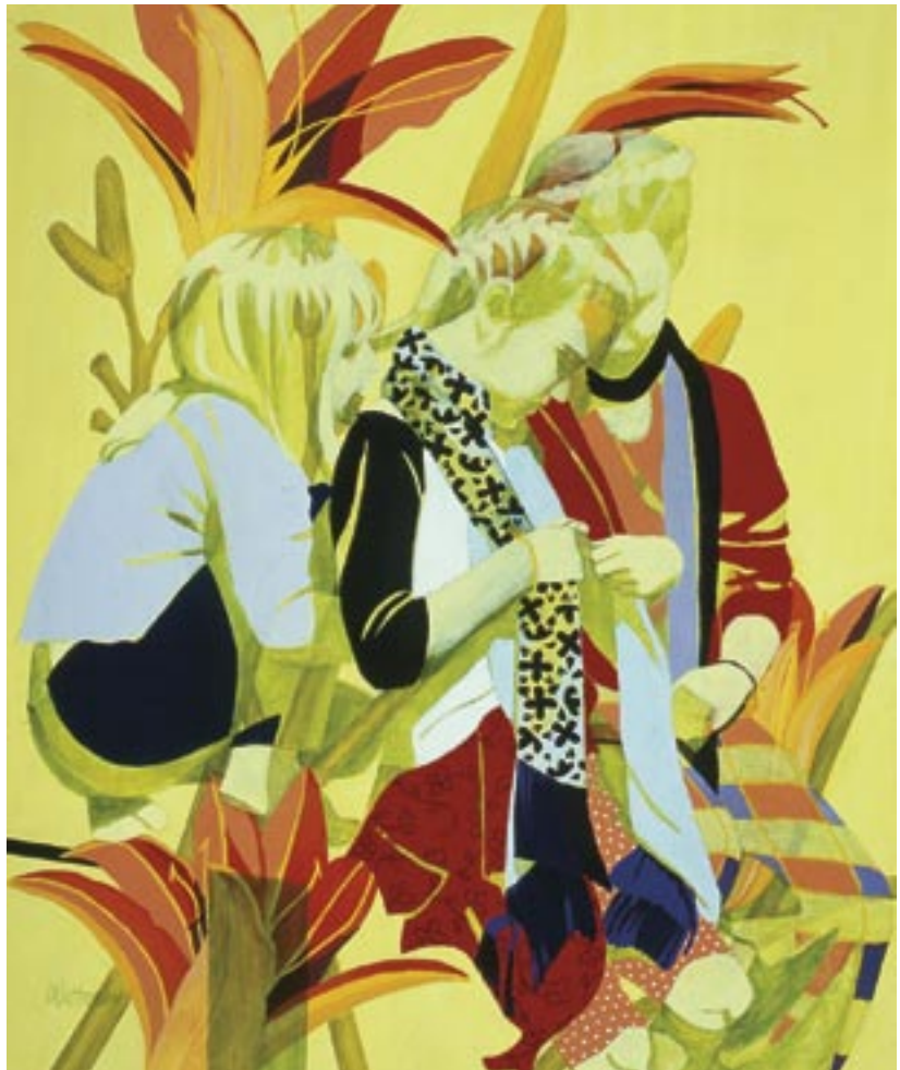
NANCY WATTERSON SCHARF Oakland, Oregon, "Come Into My Garden" Oil, 36 x 30, $1,200