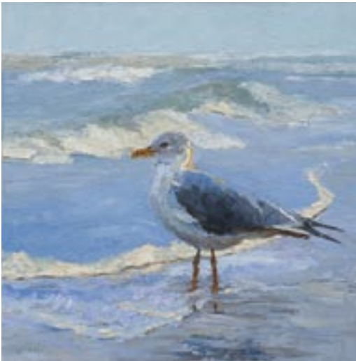
DOUG MARTIN Centennial, Colorado "Eye on the Surf" Oil, 16 x 16, $1,050