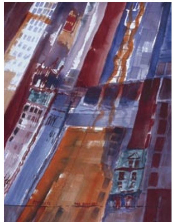
* BERNIE HERR, Florence, Oregon "Highrise Reflection", Watercolor, 22 x 15 $500