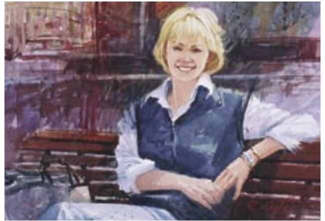
E. GILL, Portland, Oregon "Sunny Disposition", Watercolor & Acrylic, 12-1/2 x 18, $1,800