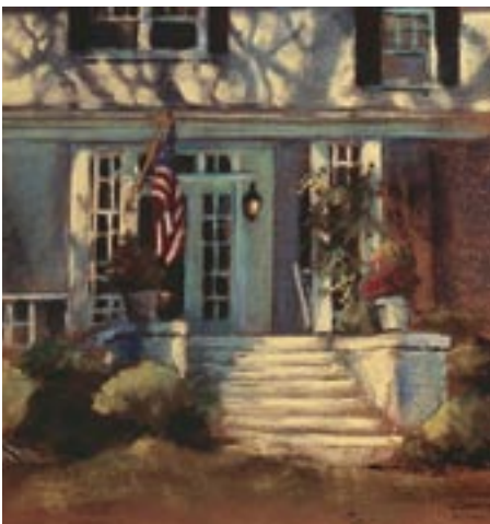
LORA BLOCK, Roseburg Oregon "Welcome Home" , Pastel, 9 x 14, $550