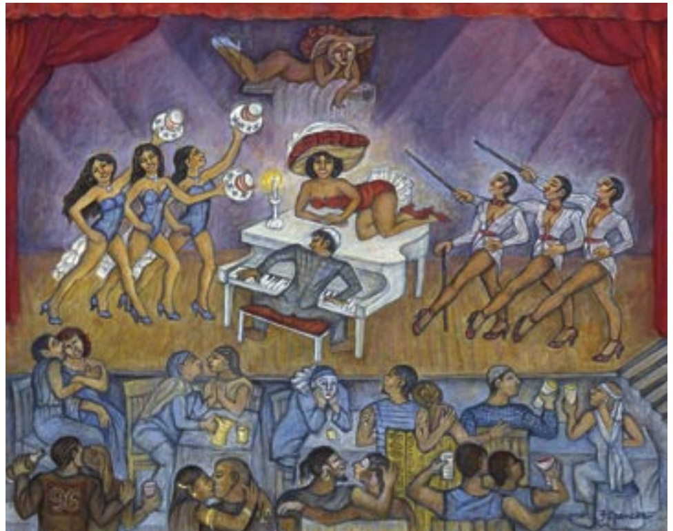
* FRANCES SPENCER, Albany, California "Cabaret", Oil, 24 x 30, $1,500