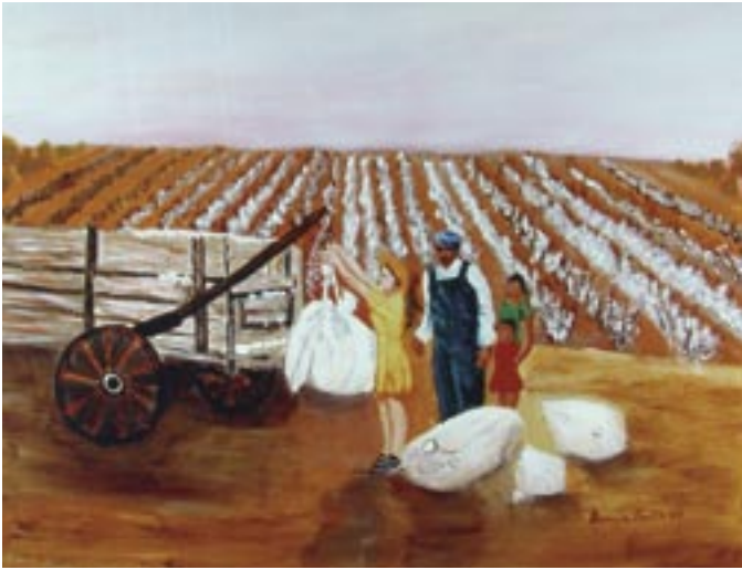
BONNIE SMITH, Springfield, Oregon "Pre Civil Rights", Oil, 16 x 20, $375