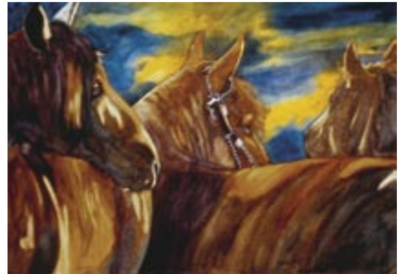
LAURIE GOLDSTEIN-WARREN Buckhannon, West Virginia "Watchful" , Watercolor, 13 x 22, $1,500