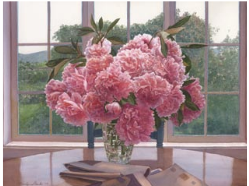
MARILYN STAUBER, Springfield, Oregon "Peonies", Watercolor, 22 x 29, $1,500