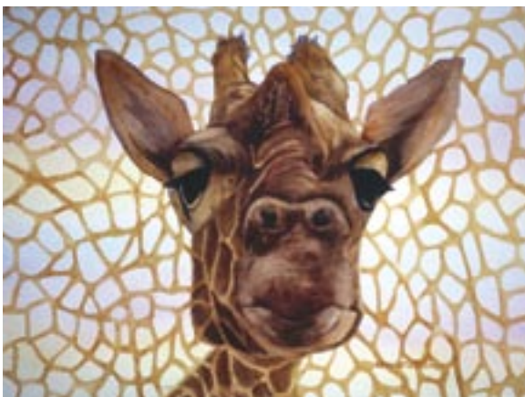
CHARLOTTE PETERSON , Central Point Oregon "Gustav's Giraffe: A Closer Look" Watercolor 11 x 15, $500