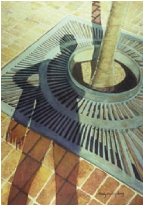
* CINDY BAILEY ASAY Eugene, Oregon "I Wasn't There", Watercolor 18 x 14, $1,200

The paintings marked with asterisks before the names on the following three pages have received special recognition by the Juror.