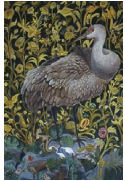
* KOBKAEW CARSON Eugene, Oregon "Being Different", Acrylic 19 x 12-1/2, $800