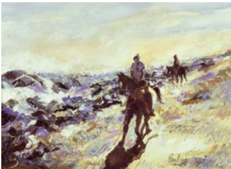
PAULINE HAUDER, Eugene, Oregon "Bracing", Gouache, 22 x 28, $850