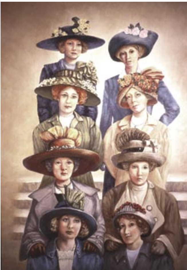
* SHIRLEY READE, Springfield, Oregon "Grand Ladies", Acrylic, 28 x 22, $1,200