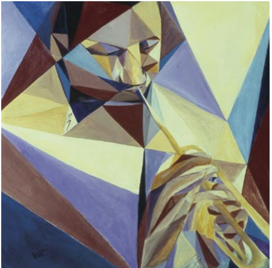
B.J. ELLEN, Springfield, Oregon, "Remember Clifford", Acrylic, 35 x 30, $1,050