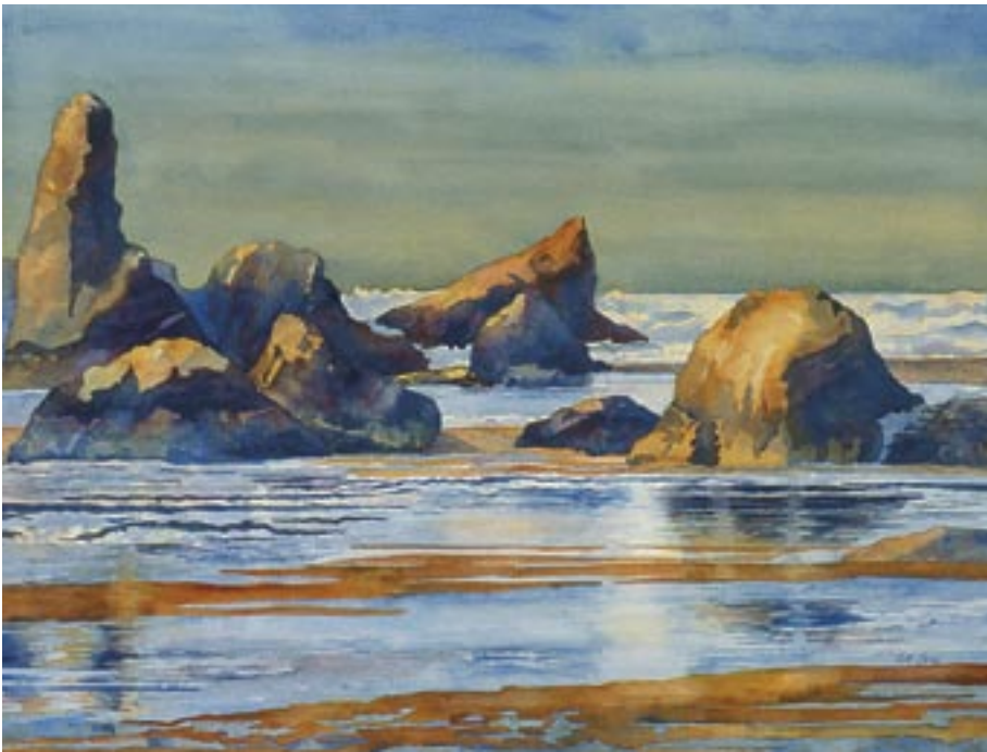
* BETTY BARSS , Medford, Oregon "Sunset Glow", Watercolor, 22 x 29, $1,450