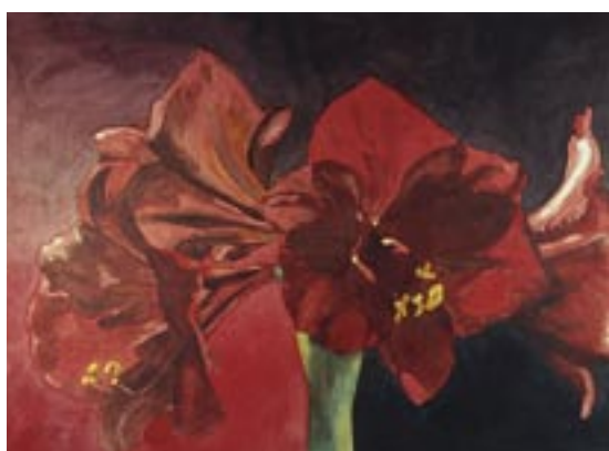
LINDA KAYE , Springfield, Oregon "Red Delight", Watercolor, 11 x 17, $500