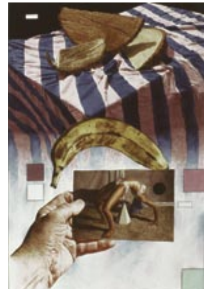
BRIAN PAULSEN Grand Forks, North Dakota "Compound Features" Watercolor, 13-1/4 x 9, $1,200