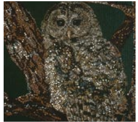
RACHEL DILLON Flagstaff, Arizona "Mexican Spotted Owl" Acrylic, 8 x 9, $750