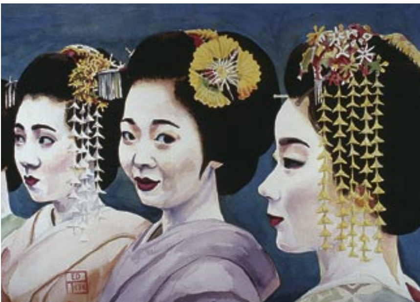
ED TRYK, Eugene, Oregon "Three Maiko Maidens", Watercolor, 19 x 27, $1,800