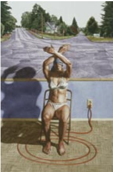
* BRIAN PAULSEN Grand Forks, North Dakota "Specific Junction", Watercolor, 13 x 9 $500