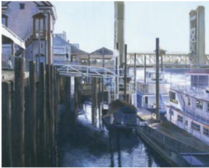
LANA CARTER, Vallejo, California "Sacramento River", Acrylic, 16 x 19, $1,500