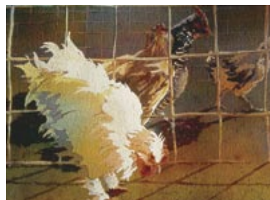
HELEN BROWN , Sunriver, Oregon "Grabenhens", Watercolor, 11 x 15, $400