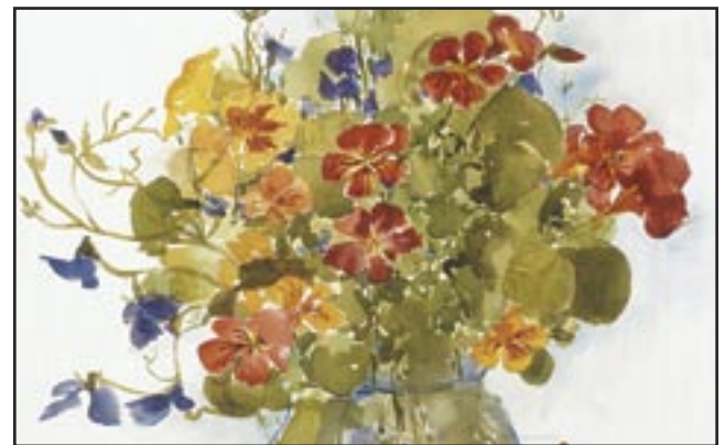
VERA GROSKOWSKY , Eugene, Oregon "Nastursiums", Watercolor, 12 x 20, $750