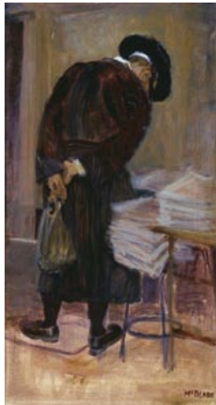
ANN McGLADE, Eugene Oregon "The Wall", Oil, 24 x 13, $3,500