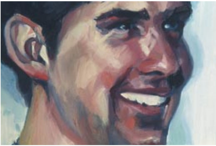
MARON RESUR, Camano Island, Washington "The Polish Prince" , Oil, 16 x 20, $500