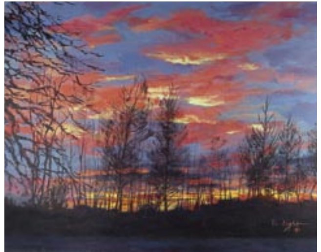
* DOTTY LIGHT, Springfield, Oregon "Blazing Sunset", Acrylic, 16 x 20, $500