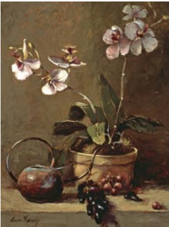
ANN HARDY, Colleyville, Texas "Orchids to You", Oil, 24 x 18, $4,000