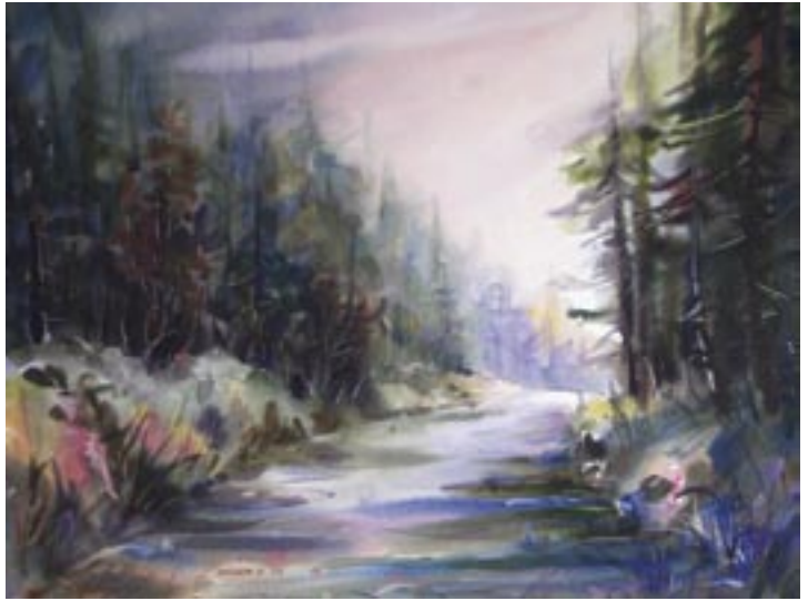
MAGDA DRUZDZEL, Gold Beach, Oregon "Old Coast Road", Watercolor, 18" x 26" , $550