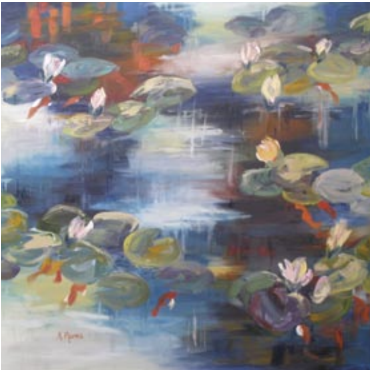
MOLLY REEVES, Lake Oswego, Oregon "Lily and Koi", Oil, 36" x 36", $1,500