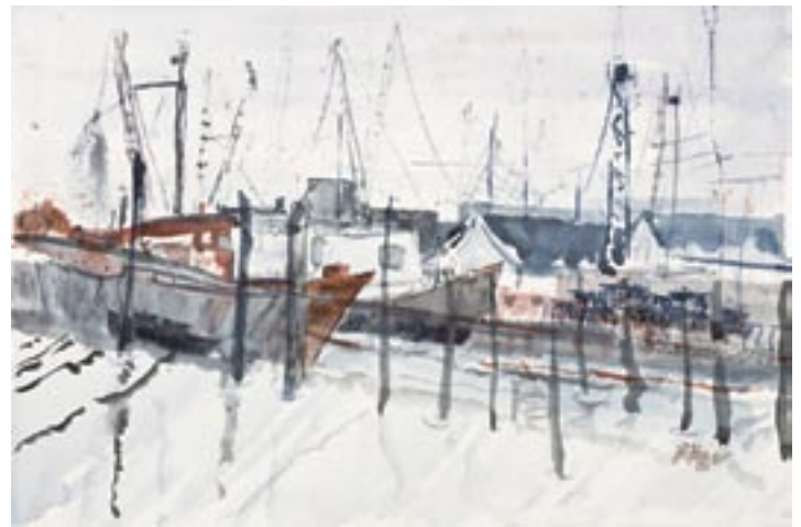
BERNIE HERR, Florence, Oregon "Sleeping Marina" Watercolor, 15" x 22" , $600