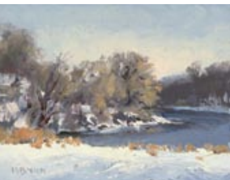
DON BIEHN, St. Paul, Minnesota "Mississippi Winter", Oil, 6" x 8", $800