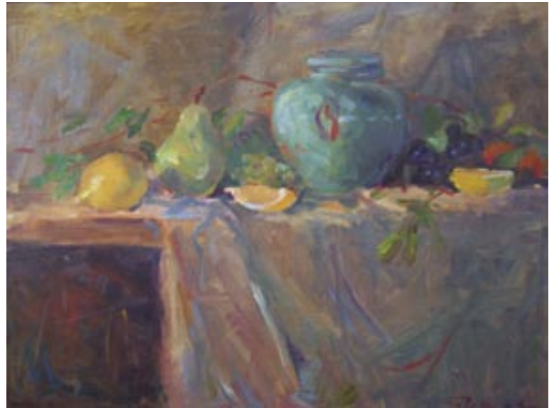
SHAUNA SHANE, STORRS, CONNECTICUT "Green Jar with Lemons", Oil, 18" x 24", $2,100