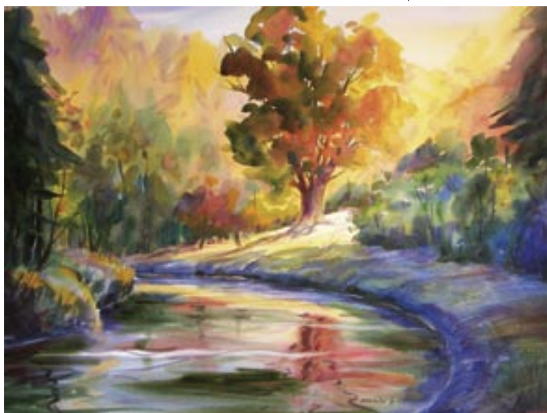
MAGDA DRUZDZEL, Gold Beach, Oregon "Fiery Oak", Watercolor, 18" x 26", $550