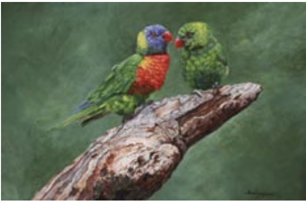
SHIRLEY REEDE, Springfield, Oregon "Lorikeets", Acrylic, 12" x 18", $600