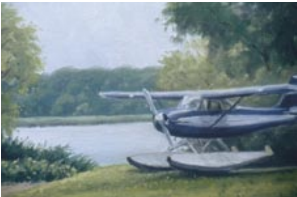
RICK W. HANSEN, Wyoming, Minnesota "The Blue Cessna", Oil, 9" x 12" , $900