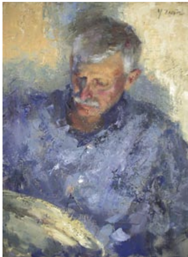
YAN TEIN, Woodinville, Washington "Cowboy", Oil, 24" x 18", $1,200