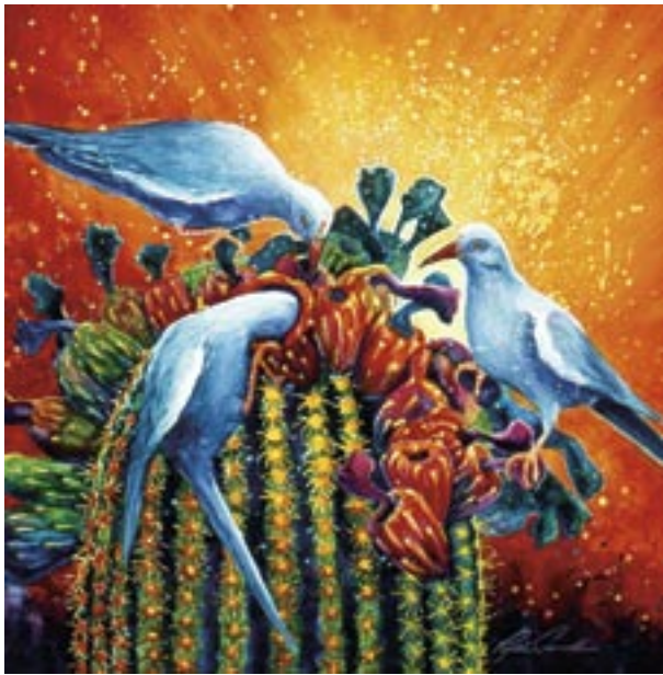
RUTH CANADA, TUCSON, ARIZONA "Fiesta", Watercolor, 16" x 16" $1,200