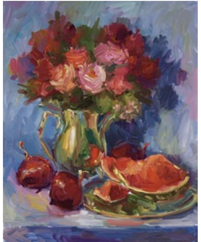
INNA CHERNEYKINA, Foster City, California "Roses and Watermelon", Oil, 30" x 24", $2,500