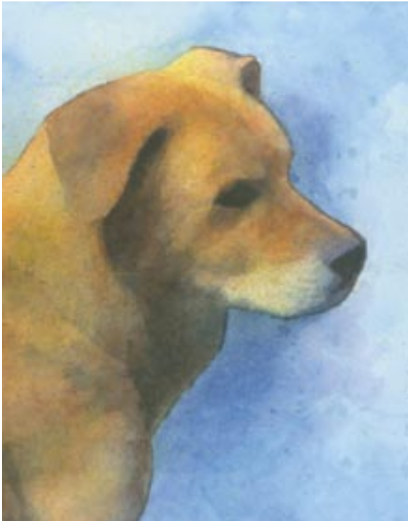
RONNIE CRAMER, Denver, Colorado "Sparky", Watercolor, 14" x 11", $500