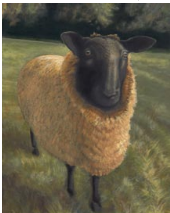
VICKI FREDRICKS, Eugene, Oregon "Samson in the Field", Acrylic, 20" x 16", $1,600