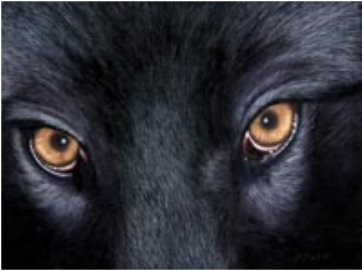
NADINE LORD, WALTERVILLE, OREGON "Wolf Stare Down", Acrylic 9" x 12", $1,200