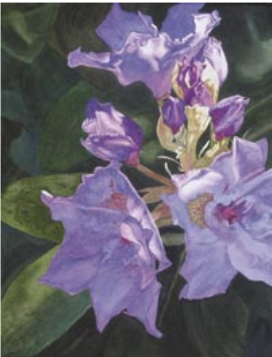
BEV PARTRIDGE, Springfield, Oregon "Morning Light", Watercolor, 18" x 12", $600