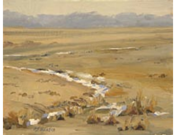
DOUG MARTIN, Centennial, Colorado "Before Class", Oil, 8" x 10", $500