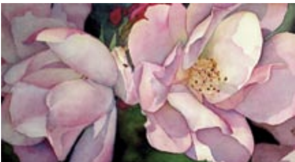
JOYCE EESLEY, Milwaukee, Wisconsin "Pink Roses", Watercolor, 5.5" x 10" , $375