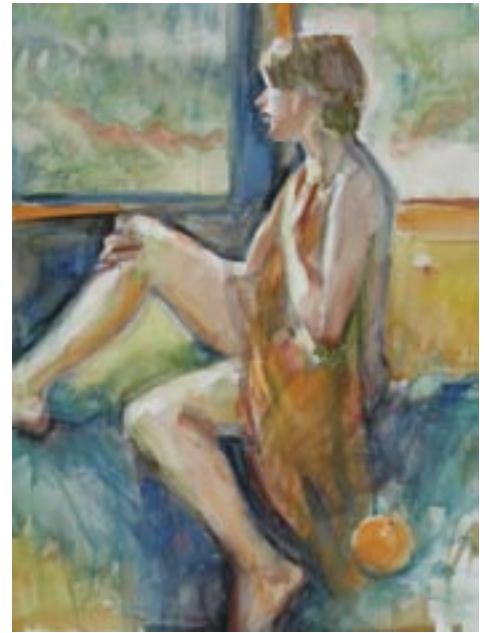
ALEXANDRA EYER Gold Beach Oregon, "Triangles" Watercolor, 30" x 22", $950