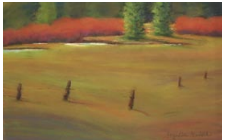
JACQUELINE NEWBOLD, Bend, Oregon "Wandering Along the Deschutes River", Pastel, 12" x 19", $750