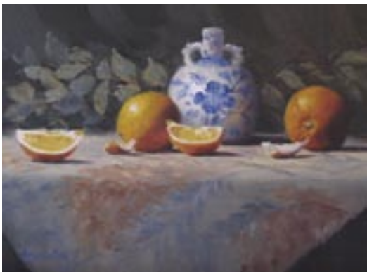
AMANDA FISH Newport Beach, California "Oranges with Blue and White Vase" Oil, 9" x 12", $750