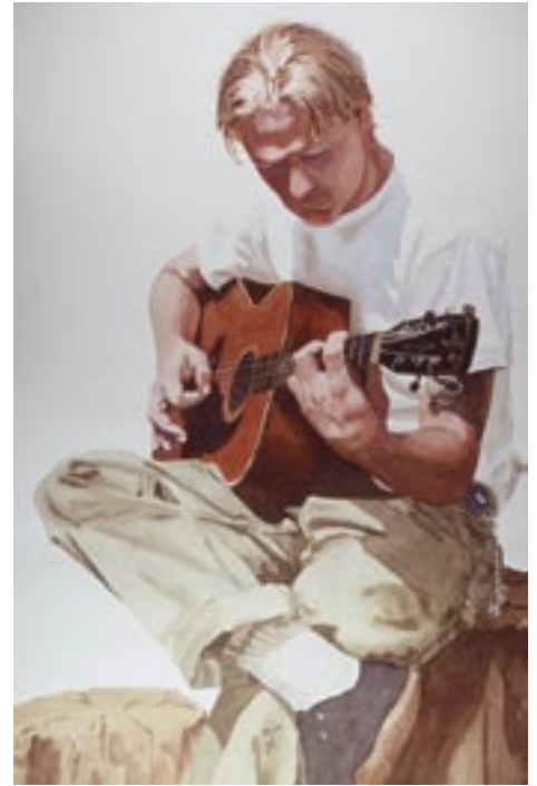
LINDA KAYE, Springfield, Oregon "The Guitar Player", Watercolor 22" x 14", $850