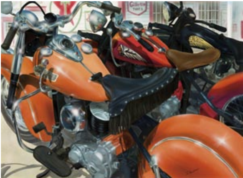
DALE BERT, Bettendorf, Iowa "Three Little Indians", Acrylic, 26" x 36", $2,200