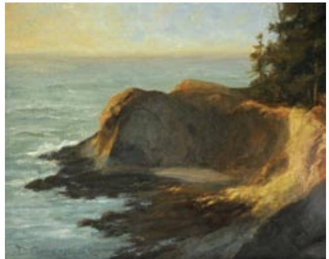
DONNA CARNEGIE, Lake Oswego, Oregon "Cove Near Cape Arago", Oil, 11" x 14", $950