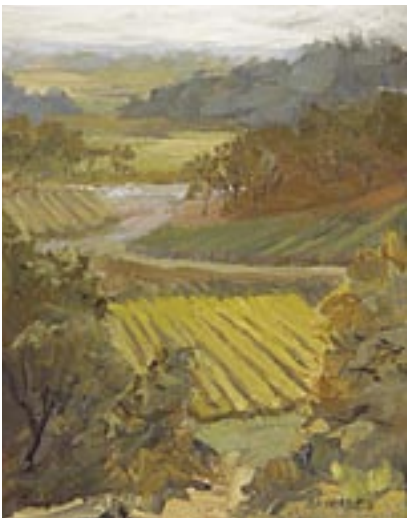
DOUG MARTIN Centennial Colorado "Napa in the Mist" Oil, 10" x 8", $500