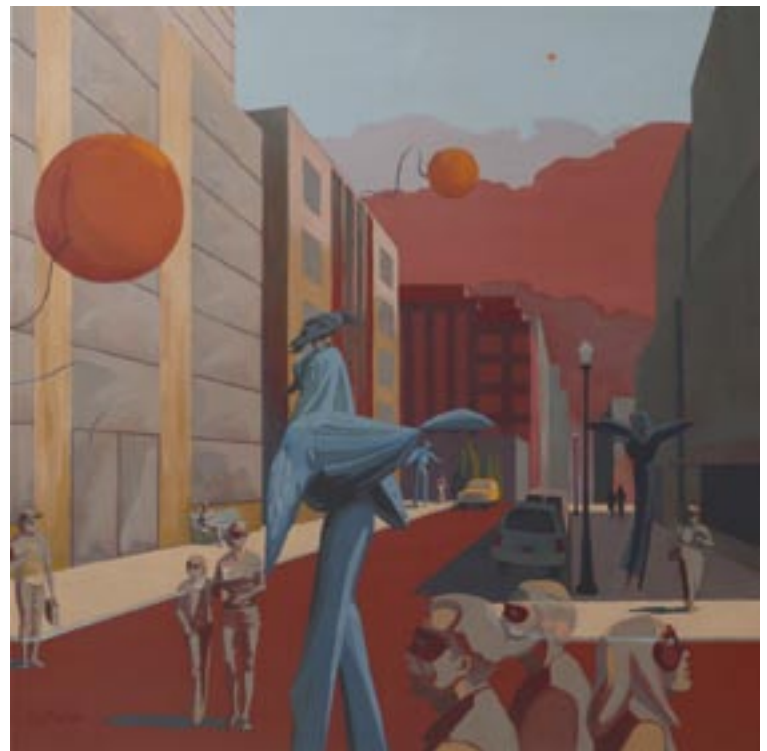
NANCY WATTERSON SCHARE, Oakland, Oregon "City Living", Acrylic, 36" x 36", $1,200