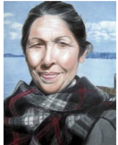
J.Y. CHANG Mountainview, California "Portrait of Augustine" Colored Pencil, 14" x 11", $1,500