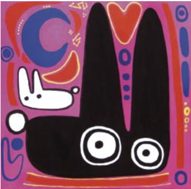
JESSICA ROLLER, Dayton, Ohio "Black Bunnyloaf", Acrylic, 24" x 24", $400