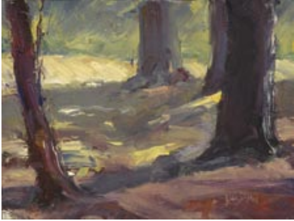
DON BIEHN, St. Paul, Minnesota "Golden Light", Oil, 6" x 8", $800

Alice Youngblood Special Recognition $100