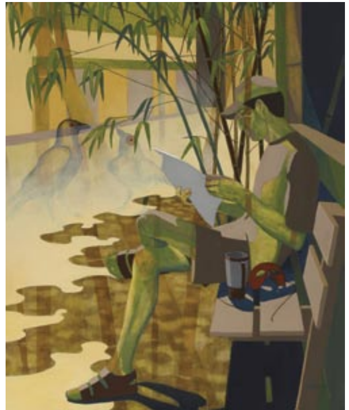
NANCY WATTERSON SCHARF, OAKLAND, OREGON "Respite", Acrylic, 36" x 30", $1,200