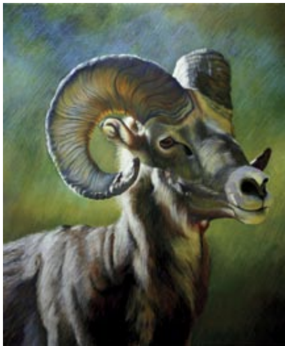
PATSY LINDAMOOD, Gainesville, Florida "Backlit Ram", Mixed Media, 23" x 20", $1,475