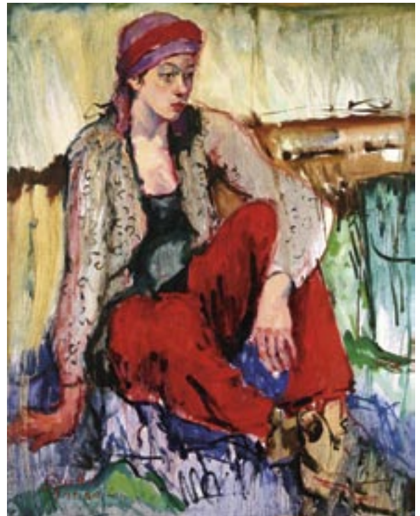
SARKIS ANTIKAJIAN, Cheshire, Oregon "Julia" Oil, 40" x 32", $2,800