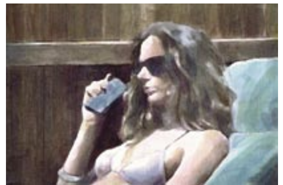
RONNIE CRAMER, Denver Colorado "Electronic Woman", Watercolor 8" x 10", $250