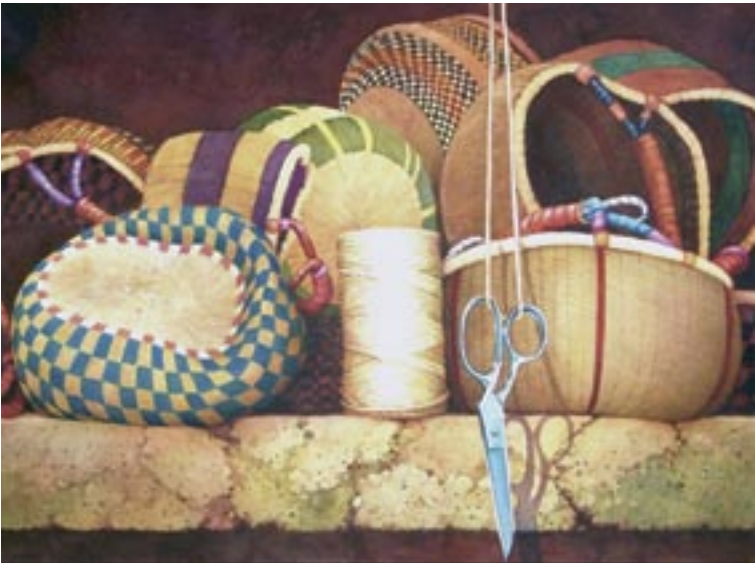
LAVONNE TARBOX-CRONE , Eugene, Oregon "A Cut Above", Watercolor, 21" x 29", $1,600