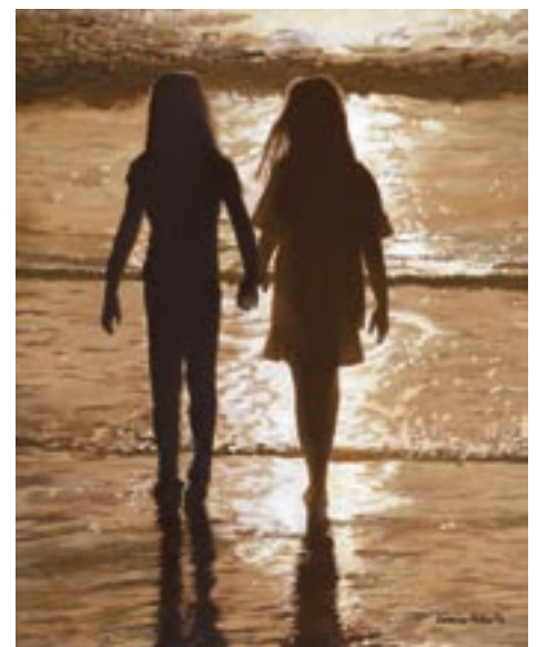
GENIE ROBERTS Springfield, Oregon "At the End of a Perfect Day" Acrylic, 20" x 16" , $1,200