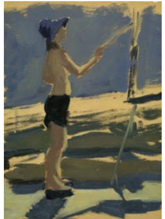
SARAH F. BURNS Ashland, Oregon, "Panda at Work" Oil, 10" x 7", $800