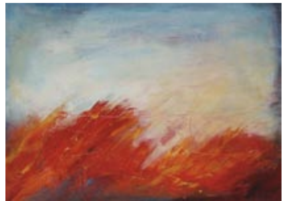
NIKKI DILBECK, Portland, Oregon "Fireline", Acrylic, 11" x 15", $475