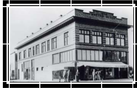
1909 construction photo

Our beautiful Emerald Art Center building is 100 years old this year, and we have a few things planned to celebrate the anniversary.