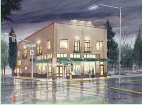
Watercolor painting by Mel Vincent